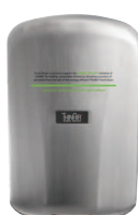
TA-SB-SI Brushed Stainless Steel Special Image