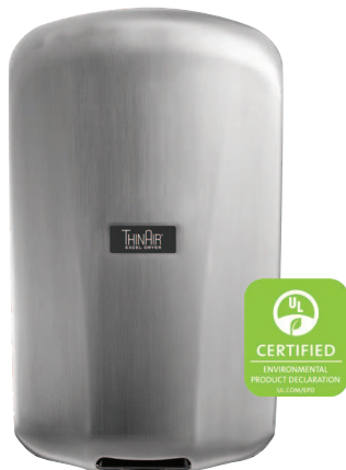
TA-SB Brushed Stainless Steel

MODELS: TA- ABS SB SB-SI SP -VOLTAGE (See Chart)