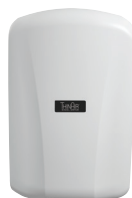
TA-ABS White Polymer (ABS)