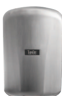
TA-SB Brushed Stainless Steel