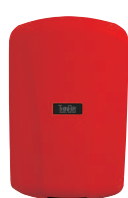
TA-SP Custom Special Paint