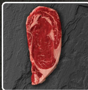
RIBEYE 10 oz., 12 oz., & 16 oz.