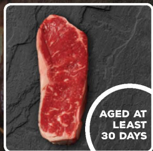
NY STRIP 12 oz. & 16 oz.

Our team is here to assist, should your recipient have a shipping delay; or an issue with their gift for any reason, we guarantee a quick resolution.