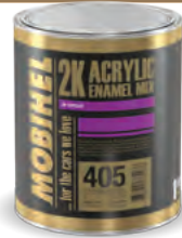
MOBIHEL 2K ACRYLIC ENAMEL