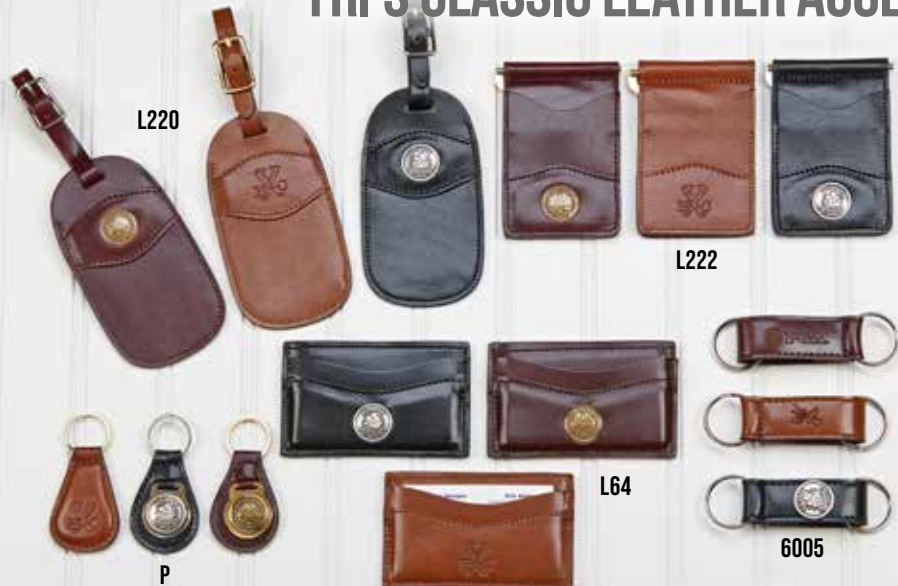
Monte Carlo Leather (Black, Tan, Brown)