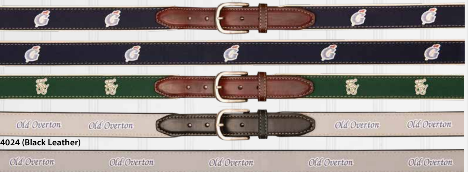
4024 (Black Leather)