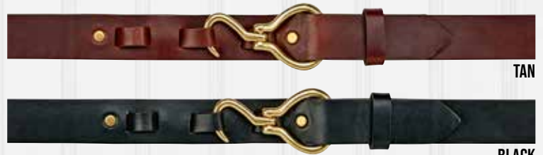
7037 - Hoof Pick Belt