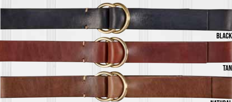
7036 - Leather O-Ring Belt