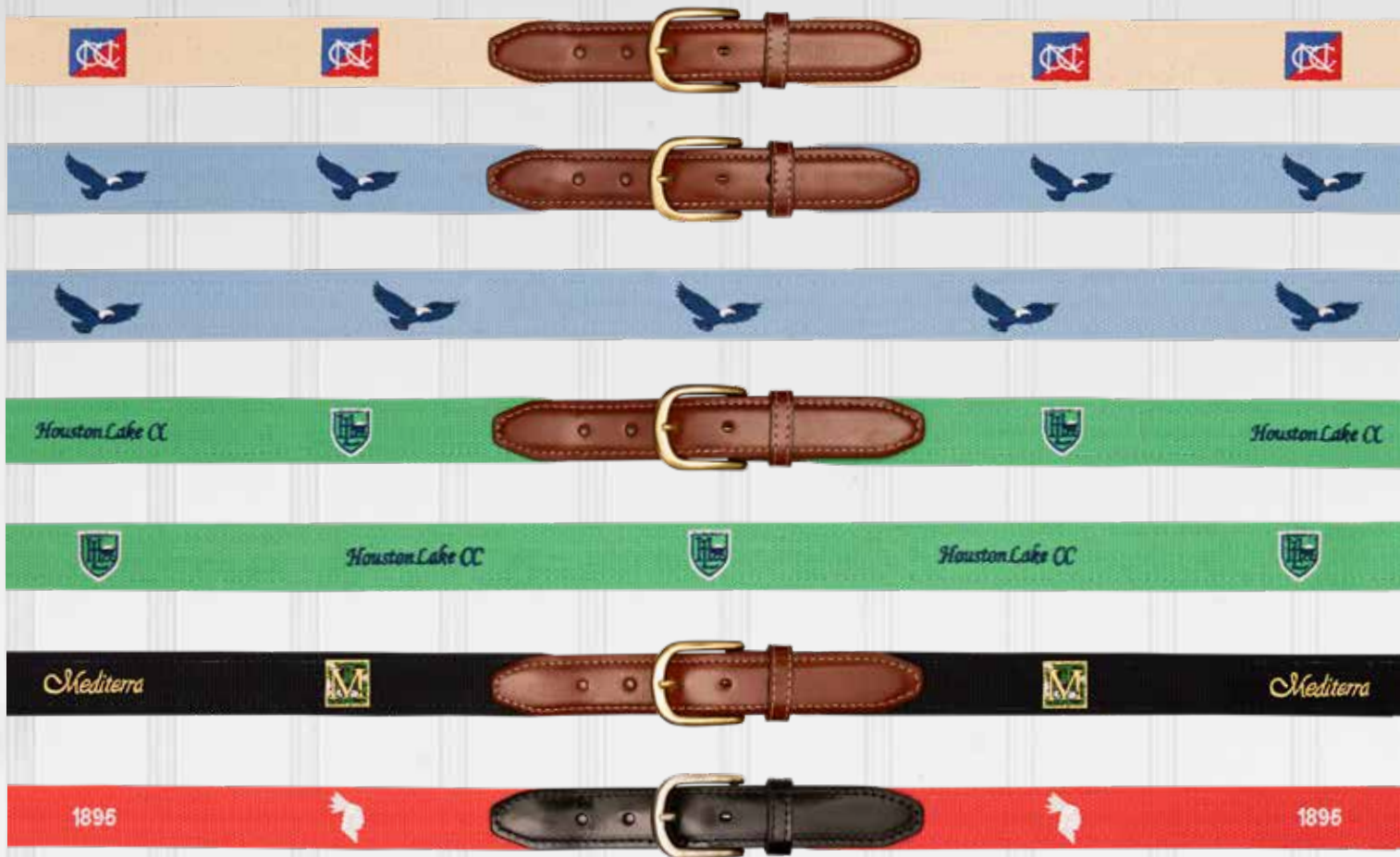
6014 - (Black Leather)