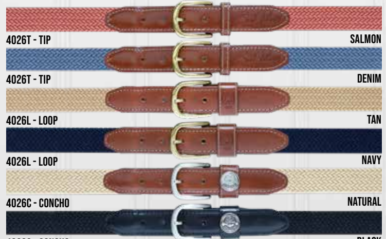
4026 - Stretch Elastic Belts (Embossing or Concho)