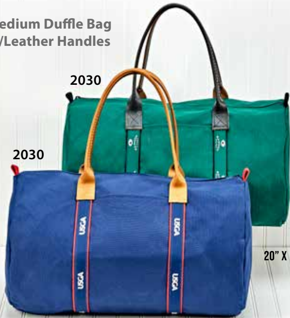
Medium Duffle Bag w/Leather Handles