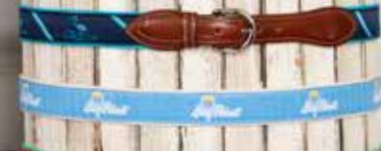
3076 - Ribbon Belt