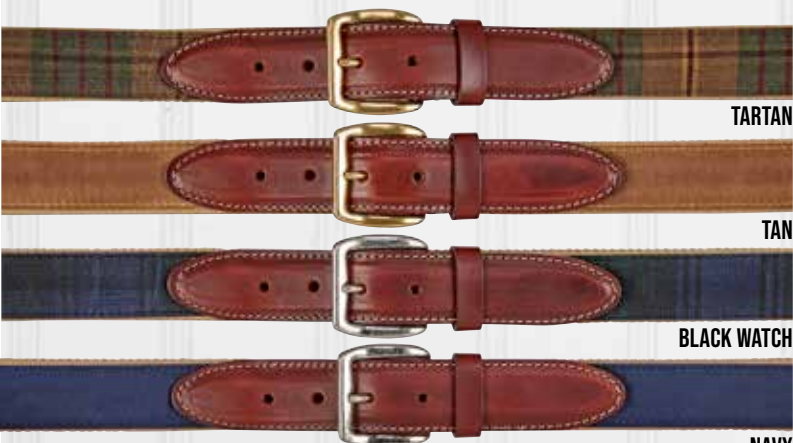
7023 - Waxed Canvas Belt