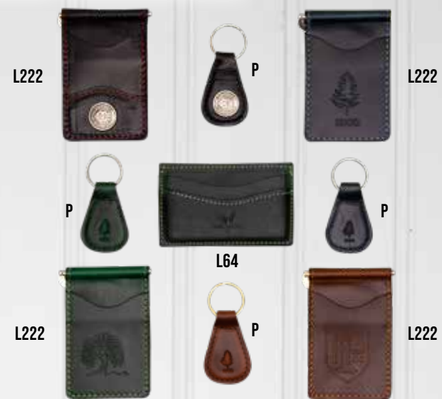
York Leather (Black, Navy, Green and Tan))