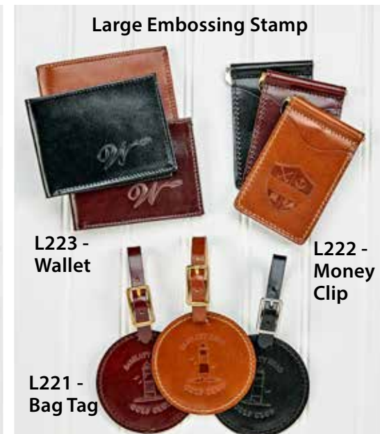
Large Embossing Stamp