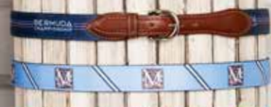
5505 - Dye-Sub