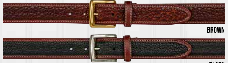
7039 - Bison Binding Belt