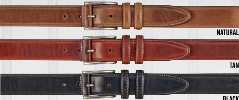
7035 - Heavyweight Rugged Belt