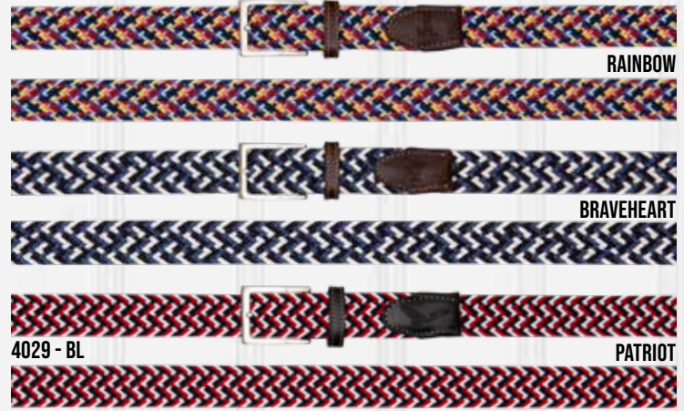
4029 - Stretch Elastic Belts (Embossing on Tip)

(See yridesigns.com for more color options)