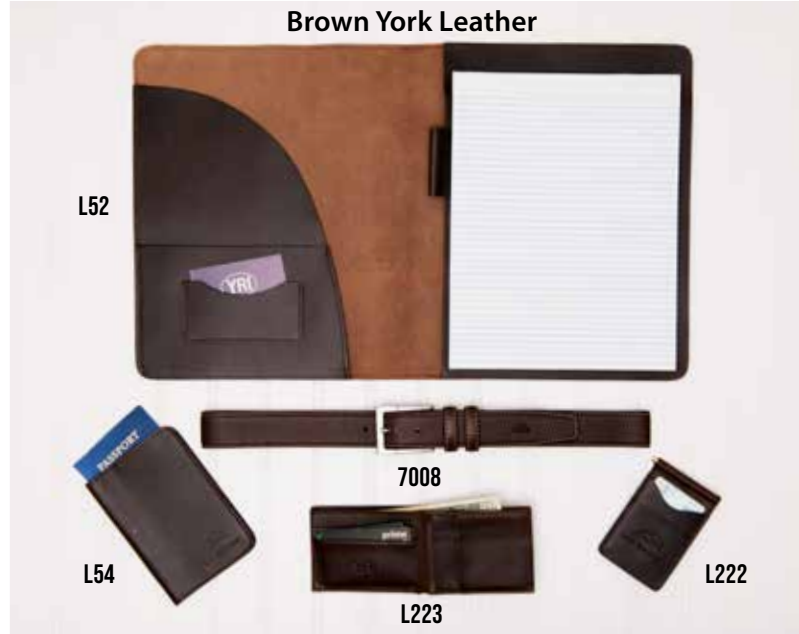
Brown York Leather