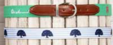
6160 - Cut to Size Embroidery