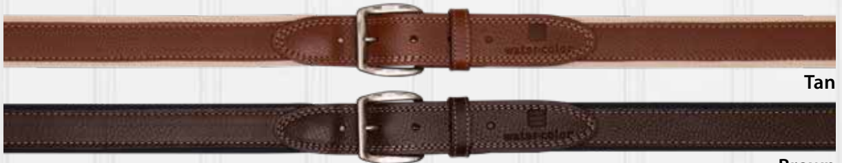
7041 - Textured Leather Belt (Embossing on Tip)