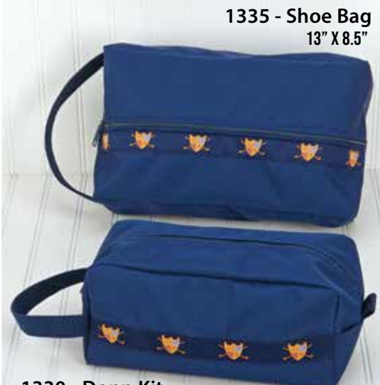
Tough Duck Bags