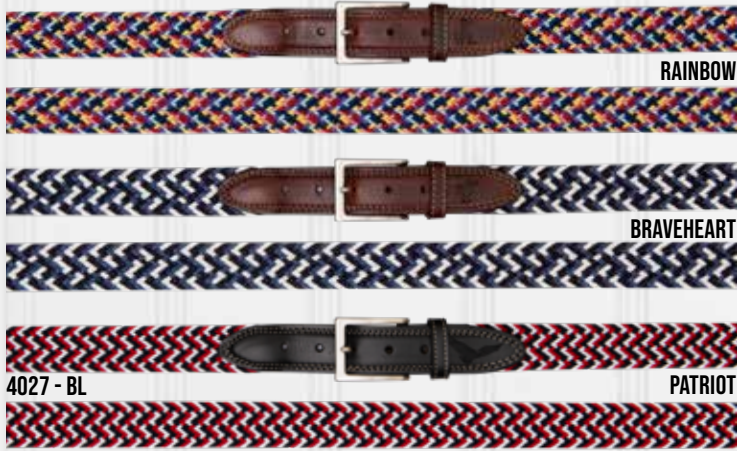
4027 - Stretch Elastic Belts (Embossing on Tip)

(See yridesigns.com for more color options)