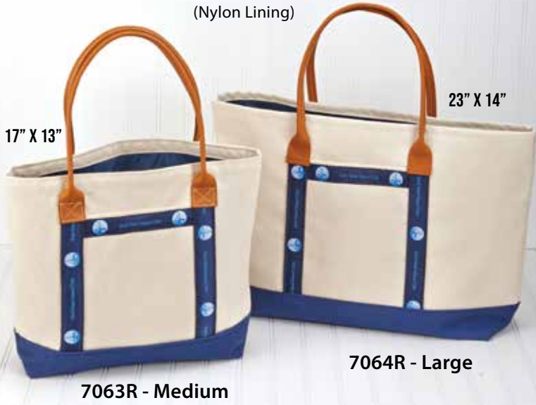
Ribbon Tote w/Leather Handles (Nylon Lining)