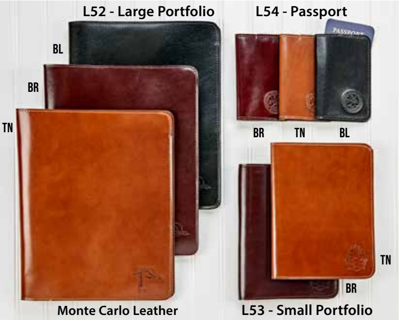
Monte Carlo Leather