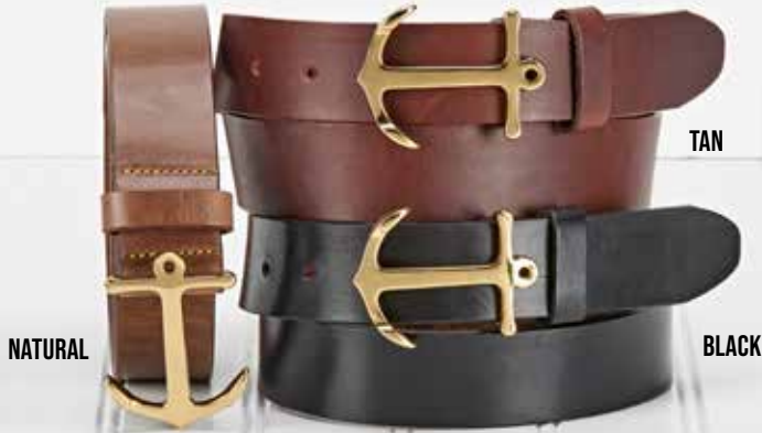
7024 - Anchor Buckle Belt (Embossing Available)