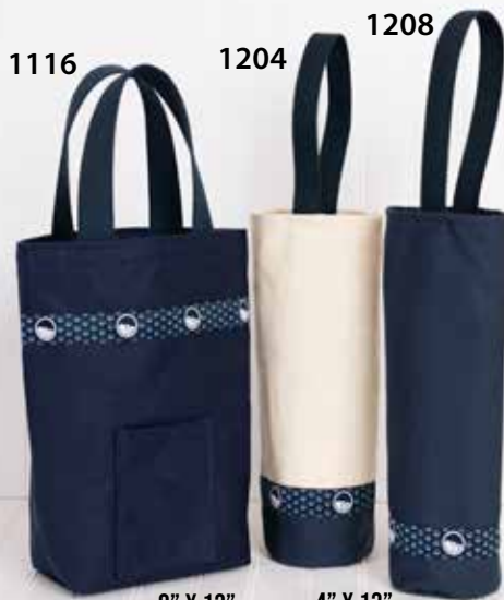
Canvas Wine Carriers