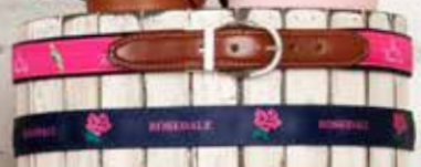
5150 - Cut to Size Dye-Sub