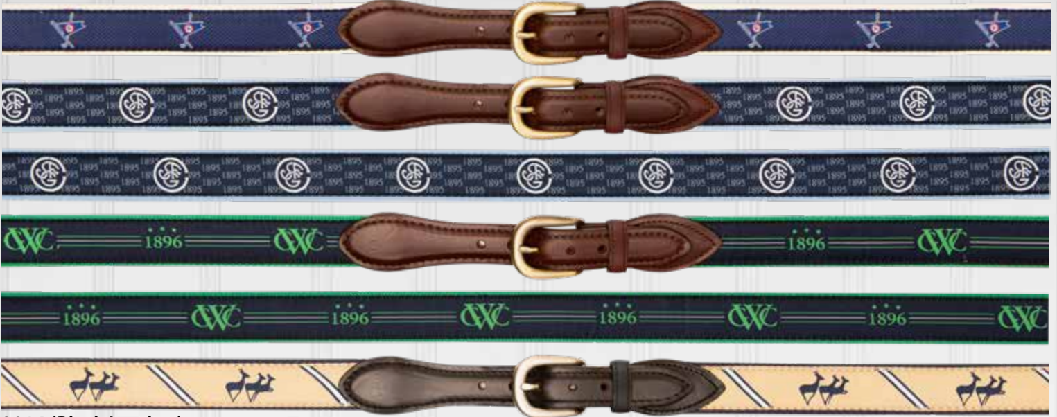
2014 (Black Leather)