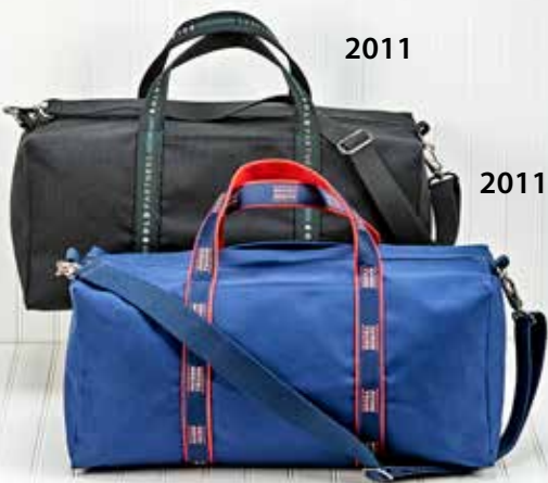
Banker Bag w/Ribbon Web Handles