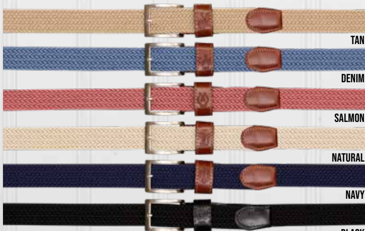
4025 - Stretch Elastic Belts (Embossing on Loop)