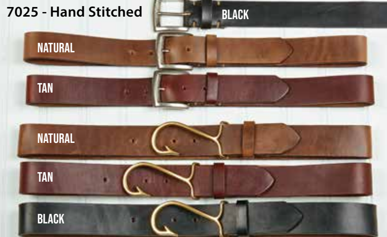
7025 - Hand Stitched 7034 - Fishhook Buckle Belt