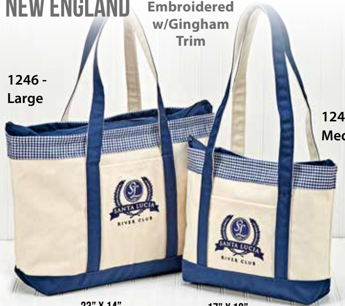
Embroidered w/Gingham Trim