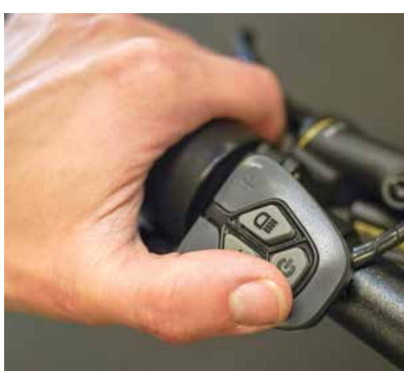
2. Power On/Off Display Hold power button on control pad for 3 seconds.