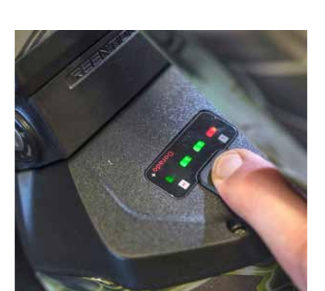
1. Power On Battery Press battery button.