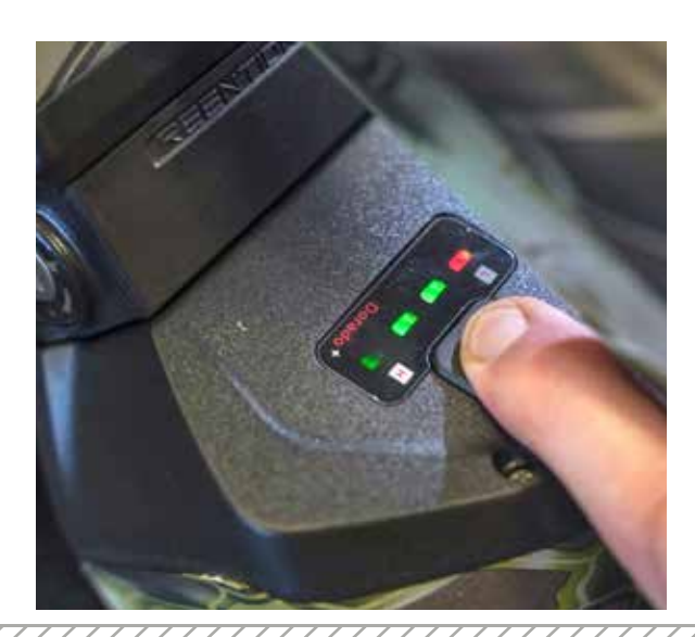
3. Power Off Battery Hold battery button for 3 seconds.