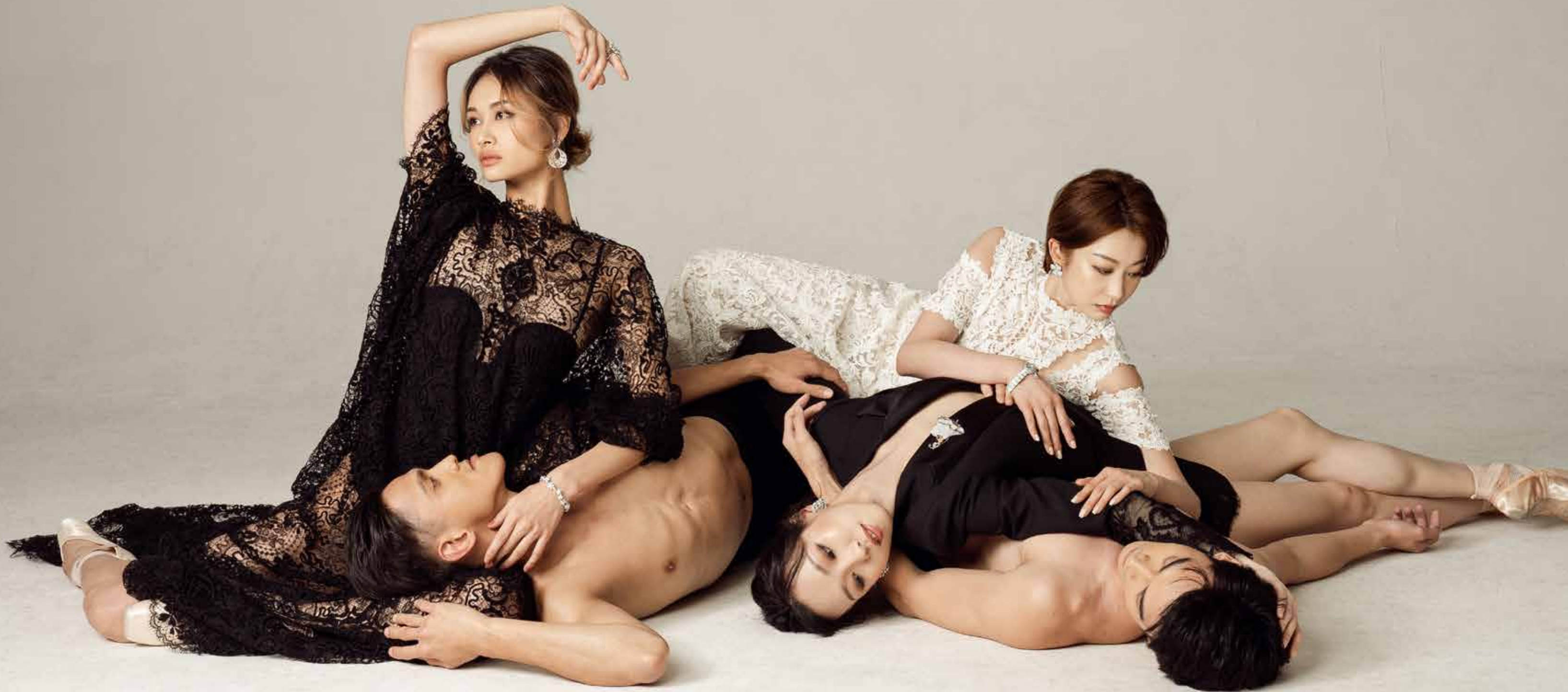
On Qingxin Snowflake earrings in platinum and white gold with diamonds, Sweet Charms watch in 18K white gold case with white gold bezel with round and baguette-cut diamonds, and Lotus Between the Finger Ring in 18K white gold with round diamonds _ Van Cleef & Arpels Black bustier _ La Perla, available from Sheer Lingerie Black floor-length lace gown _ Tom Ford