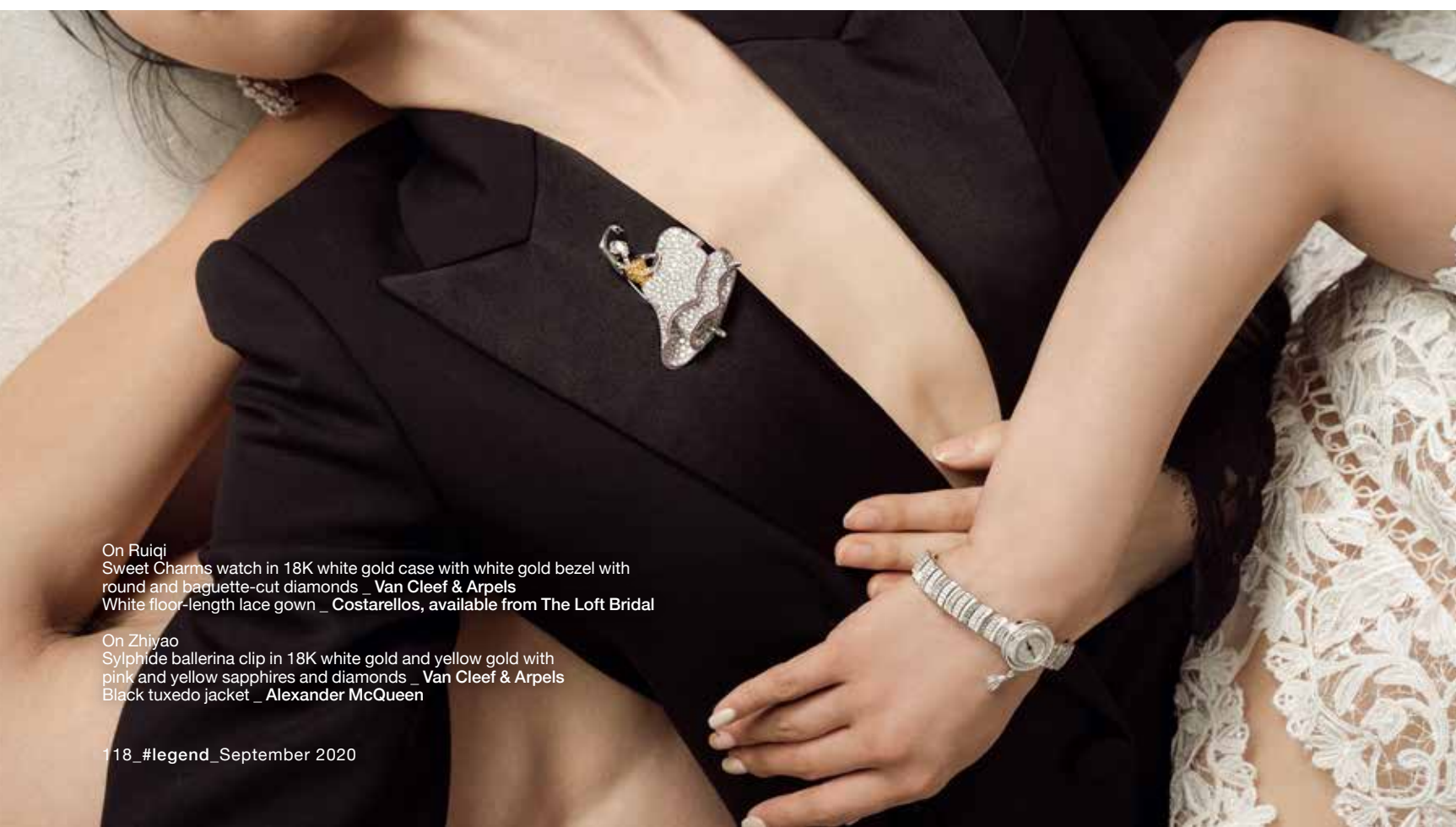
On Ruiqi Sweet Charms watch in 18K white gold case with white gold bezel with round and baguette-cut diamonds _ Van Cleef & Arpels White floor-length lace gown _ Costarellos, available from The Loft Bridal