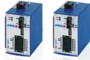
Transmitter and Receiver