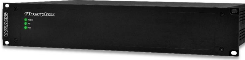
WDM16 Front View

The FiberPlex WDM is an 8 or 16 Channel Active Wavelength Division Multiplexer. Simply put, it is a device which allows the user to combine