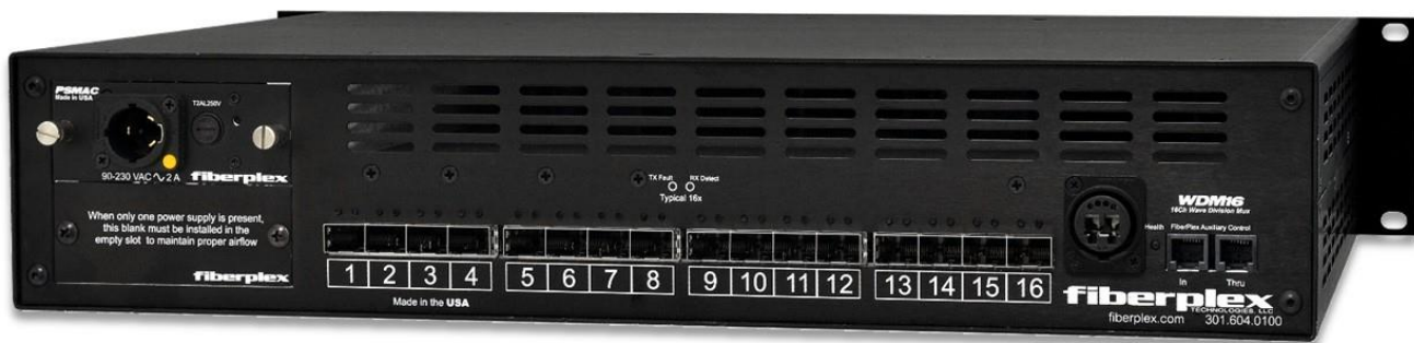
WDM16 Rear View