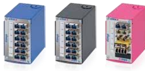
Different colours of housing and couplings