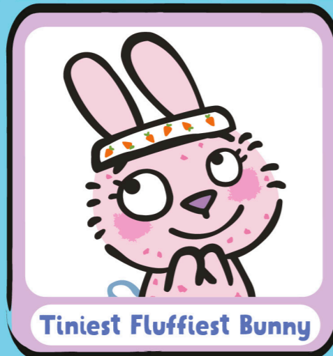
Tiniest Fluffiest Bunny