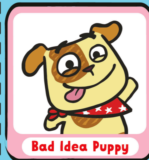
Bad Idea Puppy