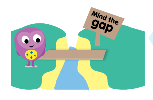
Nip over the