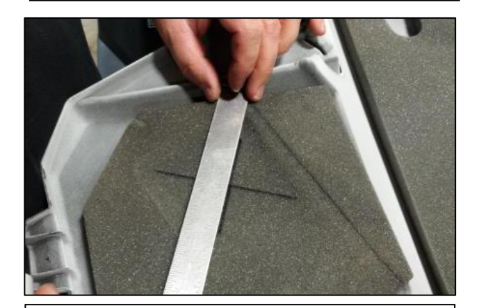
9. Using a straight edge, draw a line from corner to corner within the imprint as shown.