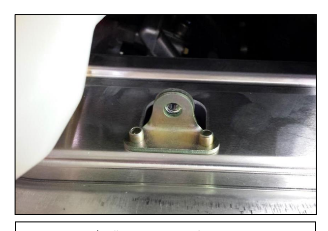
2. Using a 3/16" drill bit, carefully remove the rivets and bracket and discard both. CAUTION: DO NOT PUNCTURE THE OIL TANK.