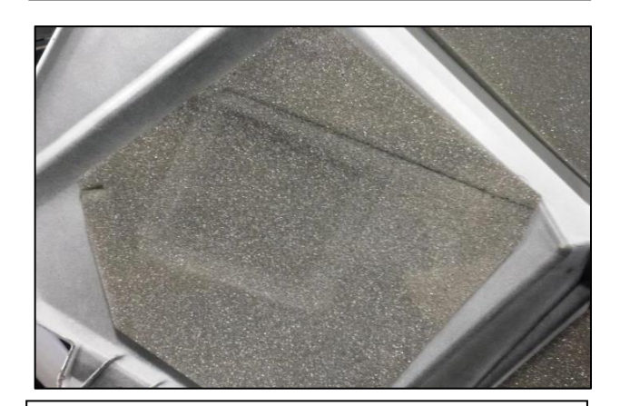
8. With the motor assembly in place, install the side panel. Now is a good time to remove the sticker from the side panel while waiting for imprint to appear on the side panel foam.