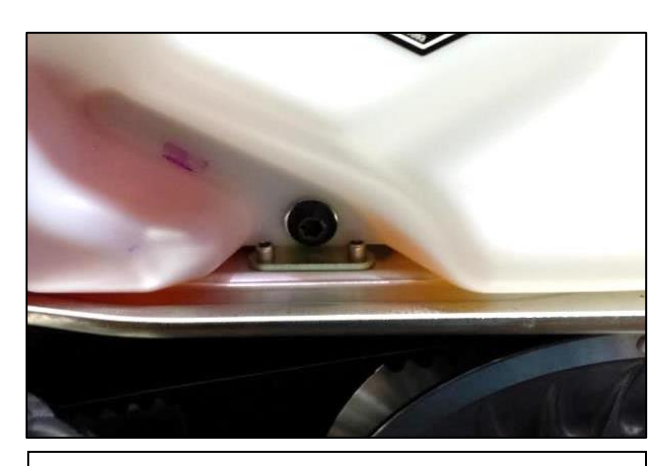
1. Start by removing the left hand side panel. Remove the oil tank retaining bolt. Save the flat washer and discard the bolt.