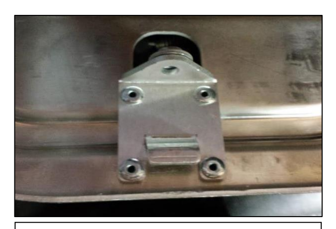
3. Place new bracket provided in the stock location. Place two steel rivets into the stock holes, then mark where to drill remaining two. Drill into the aluminum shelf and install rivets