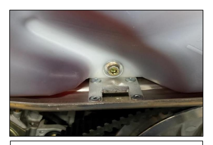
4. Install the previously removed flat washer onto the new bolt and install into the new bracket, holding the oil tank in place.