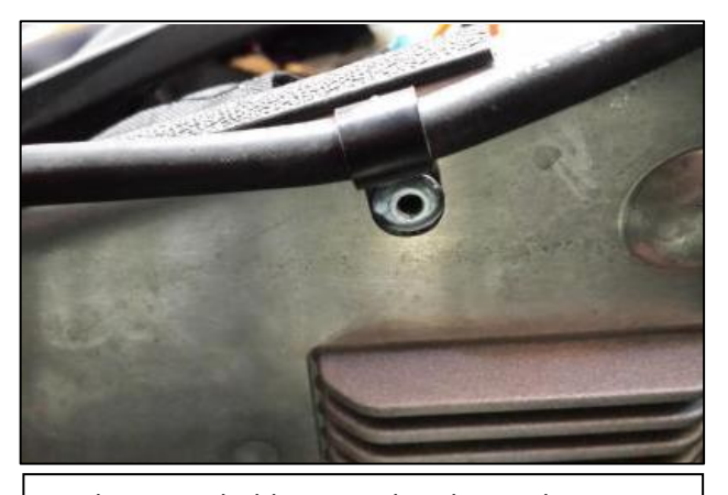
6. Place wire holder onto the Blow Hole wire then rivet into place as shown.