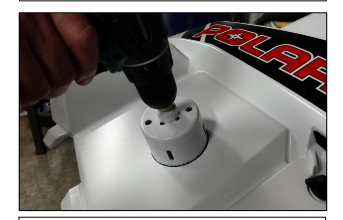
10. Drill a pilot hole in the center of the X, then using a 3" hole saw, drill a hole.