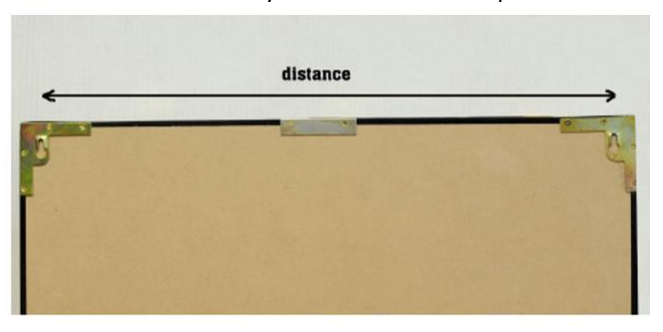
Step 6: To hang the cabinet on the wall, simply position the cabinet over the top 2 screws and align with the holes of the Tear-Drop brackets. Slide down the case and have it rest on the brackets. Now you are ready to use the cabinet to display your items, test fit the hanger with item again and adjust the hangers if need.