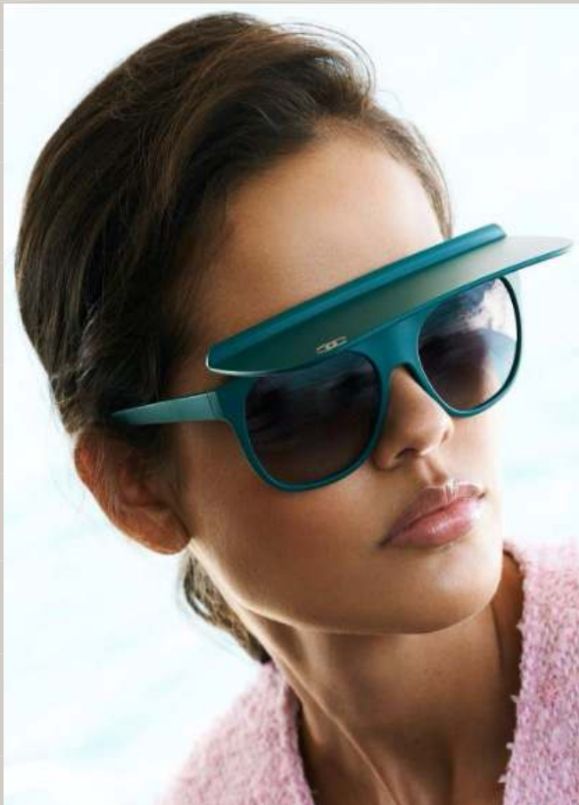
Chanel Laha Magzaine