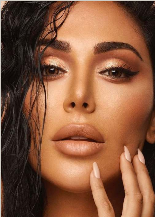
Huda Kattan for Huda Beauty