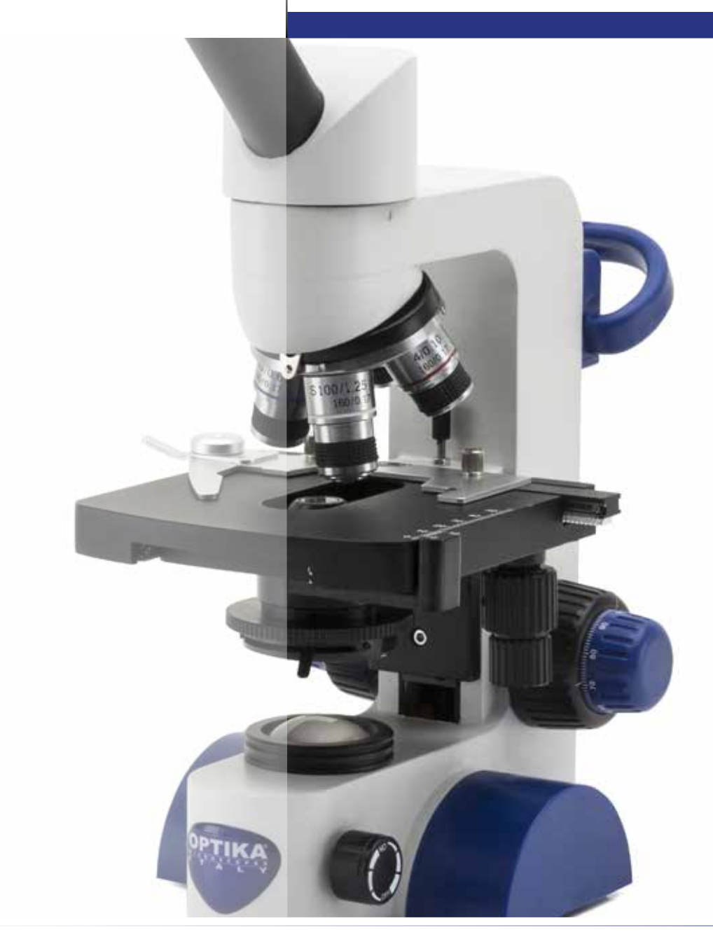
Entry-Level Biological Microscopes For Students