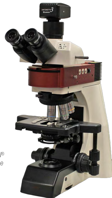
EXC-500 With FRAEN® Fluorescence Illuminator

Design, features and specifications are subject to change without notice.