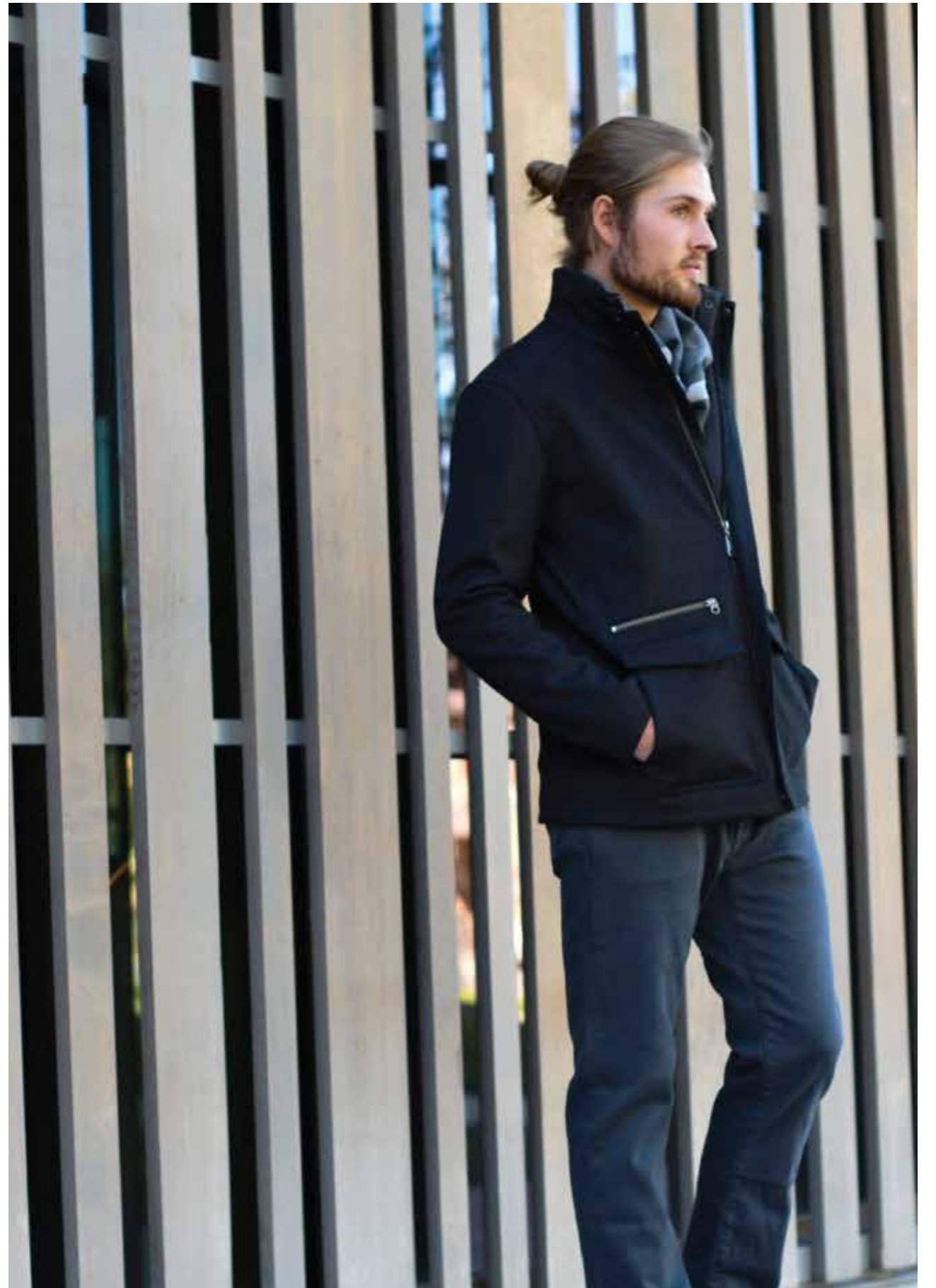
THE BENNETT | MADE IN VANCOUVER, CANADA