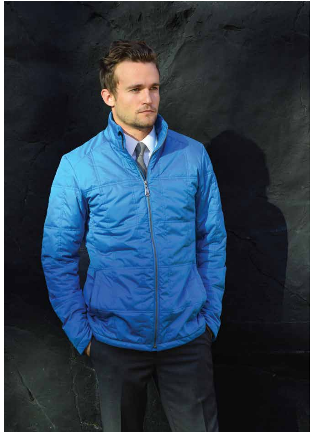
THE STRATTON | MADE IN VANCOUVER, CANADA