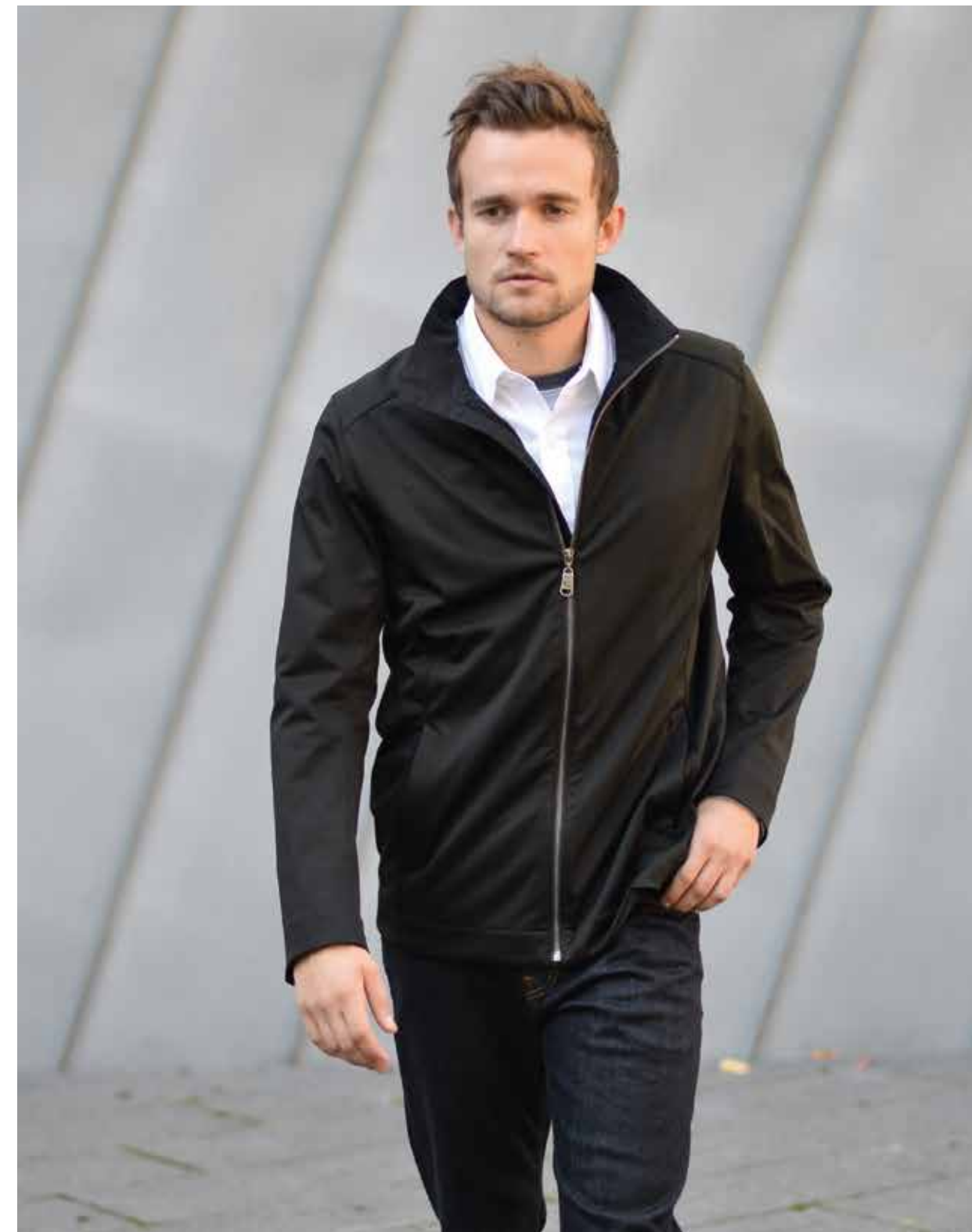
THE DILLON | MADE IN VANCOUVER, CANADA