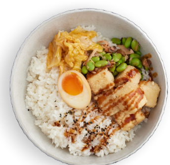
Tofu, edamame, kimchi(V) 椒鹽酥炸豆腐 $ 14.00