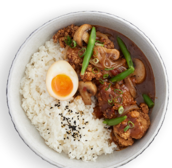
Black pepper mushroom chicken 鐵板黑椒蘑菇炸雞 $ 14.00