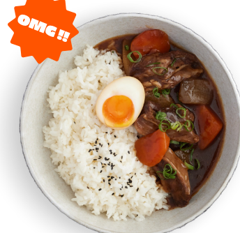
Braised premium wagyu beef 香滷燴和牛 $ 16.00