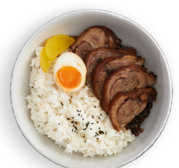
Braise pork hock 梅菜豬腳 $ 14.00