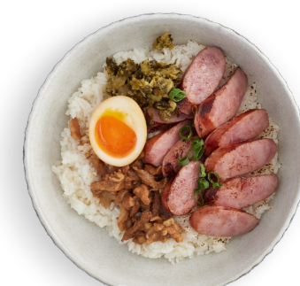
Taiwanese sausage 台灣蒜味烤香腸丼 $ 16.00