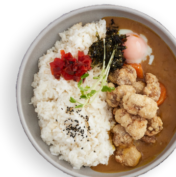
Crispy pork curry 咖哩排骨酥肉 $ 15.00