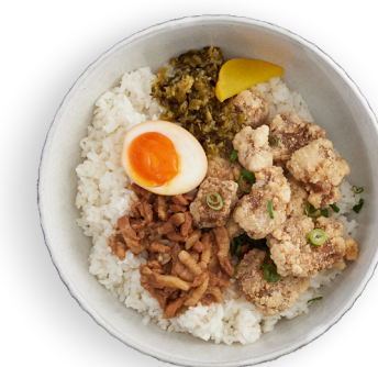
Salt pepper fried pork bite 椒鹽排骨酥肉 $ 14.00