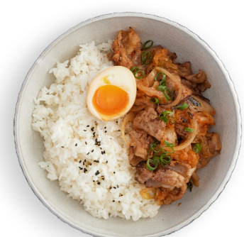
Pork belly with kimchi 炒泡菜五花豬 $ 14.00