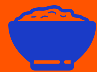
Sushi Rice 壽司飯