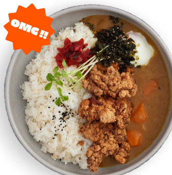
Crispy chicken curry 咖哩香香雞 $ 15.00