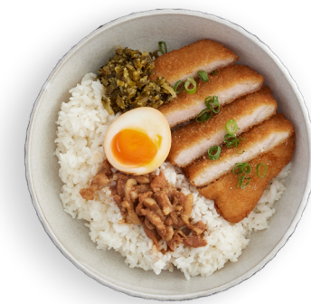
Pork katsu steak 香酥炸豬排 $ 14.00