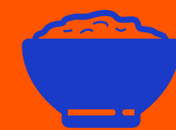
Purple Rice 紫米飯