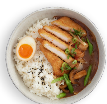
Black pepper pork katsu steak 鐵板黑椒炸豬排 $ 14.00