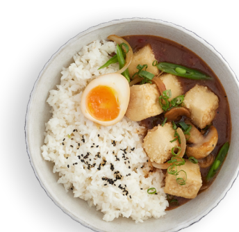
Black pepper tofu and veg(V) 鐵板黑椒豆腐鮮蔬 $ 14.00