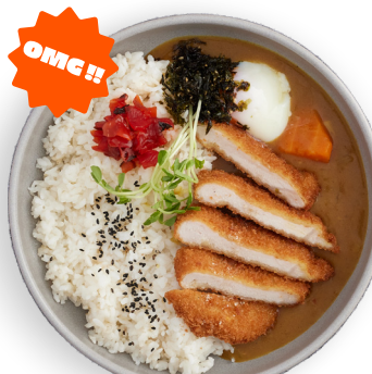
Pork katsu steak curry 咖哩炸豬排 $ 15.00