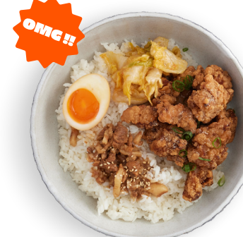
Boneless crispy fried chicken 台式香香雞 (鹹酥雞) $ 14.00