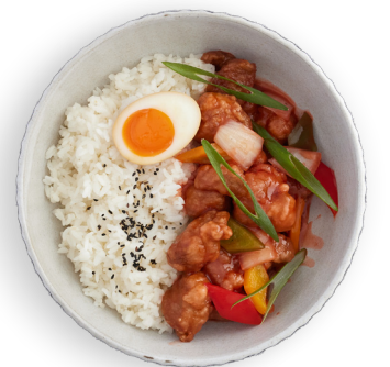
Sweet sour crispy pork 糖醋排骨酥肉 $ 14.00