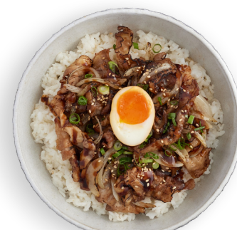
Pork belly 醬燒豬五花丼 $ 14.00