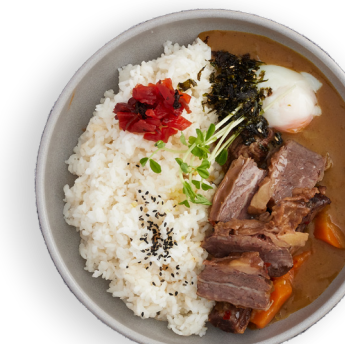
Premium wagyu beef curry 咖哩牛肉 $ 17.00