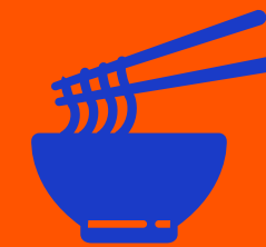
Udon Noodle 烏冬麵