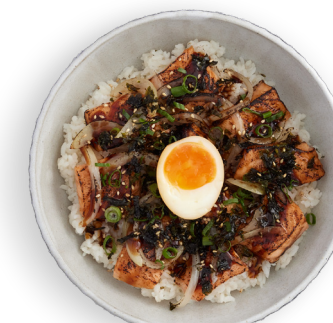
Flame torched glazed salmon 炙燒鮭魚丼 $ 17.00