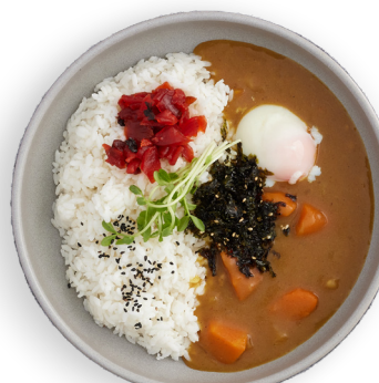
Plain veg curry with hot spring egg (V) 溫泉蛋咖哩 $ 12.00