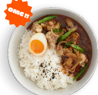
Black pepper crispy pork bite 鐵板黑椒排骨酥肉 $ 14.00