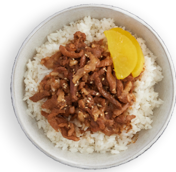
Classic Taiwanese Lu Rou Fan 台式滷肉飯 $ 10.00