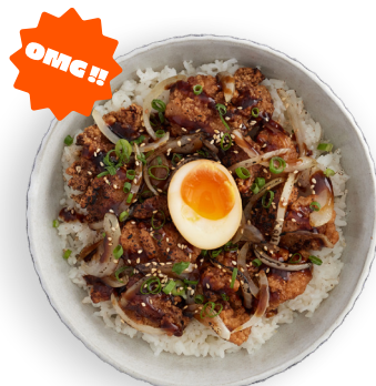
Teriyaki chicken thigh 日式照燒雞丼 $ 14.00