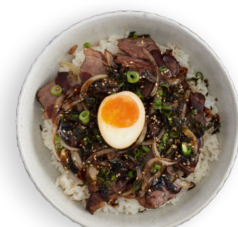
Premium wagyu beef rib 燒烤和牛肋條丼 $ 17.00