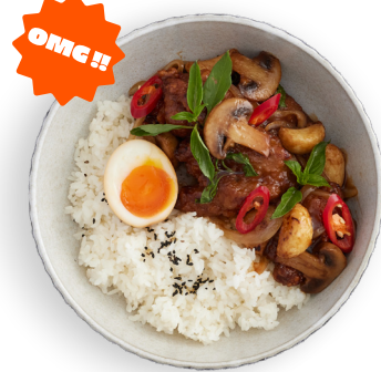
Three cup chicken 三杯雞 $ 14.00