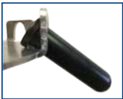
Angled at rest