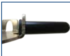
Horizontal while spinning