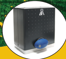
Deimos BT 24V rack & pinion slider operator for gates up to 1,100 lbs