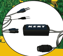
ECOSOL Charger for rapid charging of batteries from standard electrical outlet