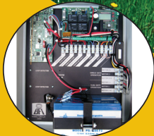
12" x 14" pre-wired Ecosol Libra enclosure with batteries