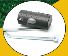
Igea BT 24V articulated arm for gates up to 550 lbs