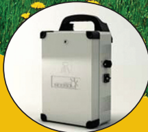
Ecosol easy to connect interface with batteries