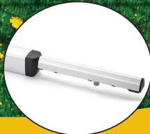
Phobos BT & BT L 24V DC operators for swing gates up to 16.5' & 550 lbs