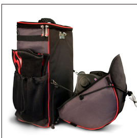
Secure HelmetCatch™ 5-point rigging system keeps helmet safe and easily accessible