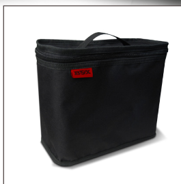
Free insulated lunch cooler and utility carabiner included