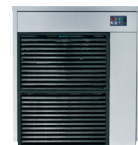
ICE QUEEN 500