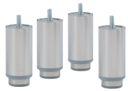
4 HEIGHT ADJUSTABLE LEG KIT