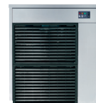
ICE QUEEN 300