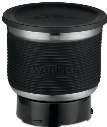
CAC128 Stainless Steel Bowl with Lid