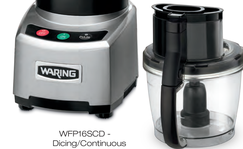
WFP16SCD - Dicing/Continuous Feed Chute and Batch Bowl