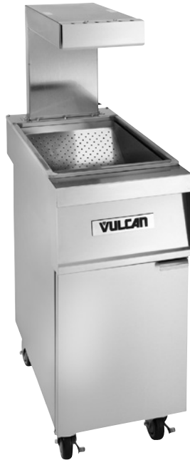
Frymate VX15 shown with optional ThermoGlo™ Food Warmer