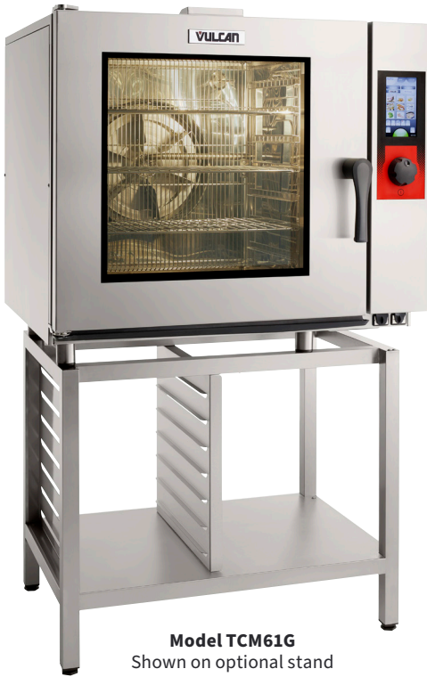
Model TCM61G Shown on optional stand