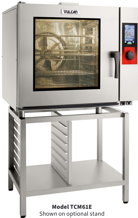
Model TCM61E Shown on optional stand