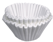
FILTERS, 20x8 252/CS 36/CL