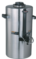
TITAN TF SERVER, VERTICAL FCT