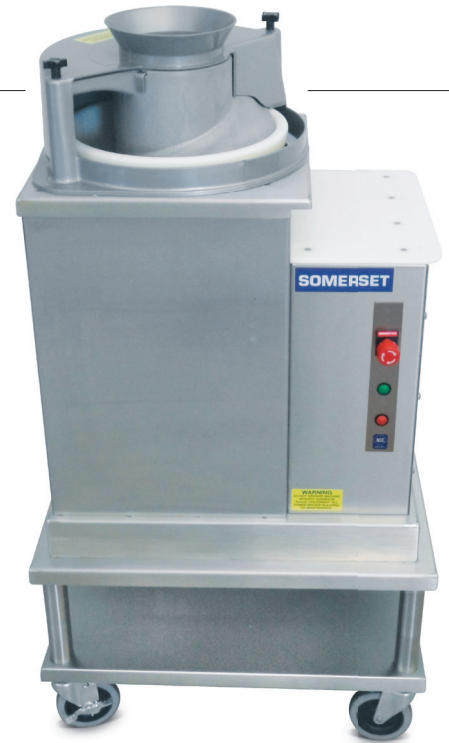
Rounder with Table SDR-400T