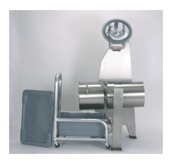
FOOD CART SHOWN WITH VCM