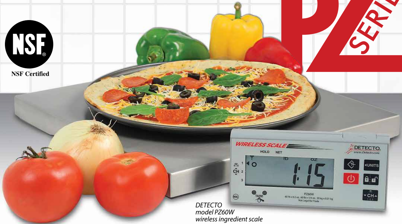
DETECTO model PZ60W wireless ingredient scale