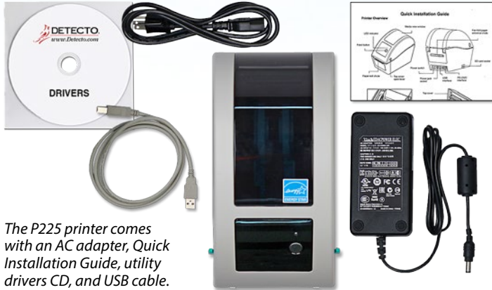
The P225 printer comes with an AC adapter, Quick Installation Guide, utility drivers CD, and USB cable.

The P225's clamshell design provides easy access to media for cleaning and installation. This printer is capable of printing a variety of labels up to 2-inches wide including continuous, die-cut, black mark, fan-fold, and notched via the external label entrance chute. Labels print at speeds of up to 5 inches per second at 203 DPI. The P225 is capable of printing a variety of graphics and logos through the printer software or Cardinal Scale's nControl label software. Graphics, bar codes, and logos may be stored on the printer's microSD flash memory up to 4 GB (microSD card not included).