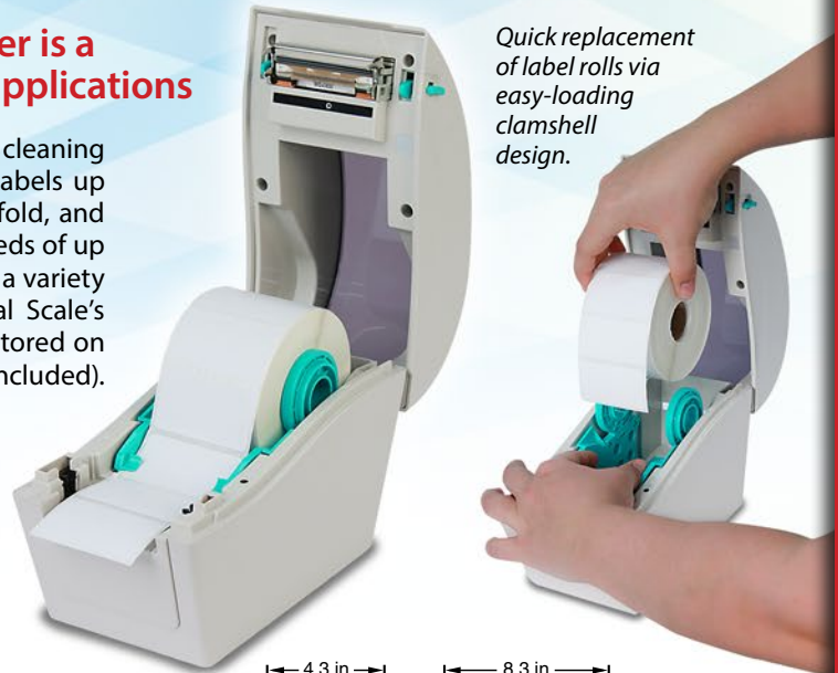
Quick replacement of label rolls via easy-loading clamshell design.