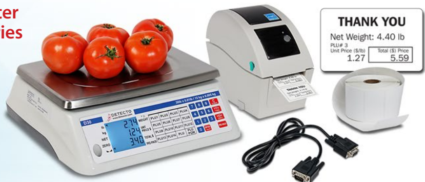
The P225 printer may be connected with DETECTO's D series scale via RS232 serial cable (part no. 7100-0025). P225 labels available from DETECTO (part no. 7100-0026) in single rolls or by the case (case is 12 rolls).

DETECTO's P225 printer is an easy-to-use, high-quality solution for many applications that require a fast and accurate printing option. This space-saving direct thermal label printer is designed to work with the DETECTO D series price computing scales. The P225 is also compatible with all Cardinal weight indicators and DETECTO food service scales with RS232 serial connectivity.