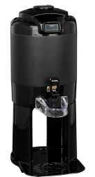
TF SERVER, DSG2 1.5G BLK CD