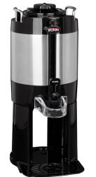
TF SERVER, 1.5G/5.7L MECH