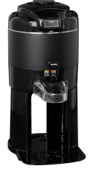
TF SERVER, DSG2 1G BLK CD