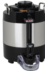
TF SERVER, 1G/3.8L MECH NOBASE