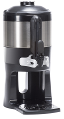
TF SERVER, 1G MECH GEN3