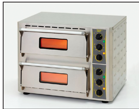
PZ 430D 208/240 V CAPACITY: 2 - 16" pizza