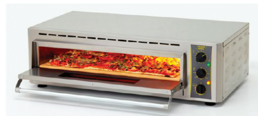
CAPACITY: 1 - 16" x 24" rectangular pizza or several personal size pizzas