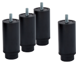
4 HEIGHT ADJUSTABLE LEG KIT