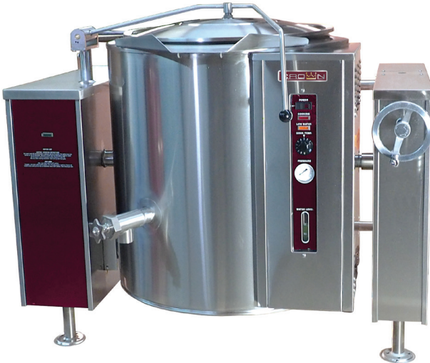
Shown with optional spring assist cover