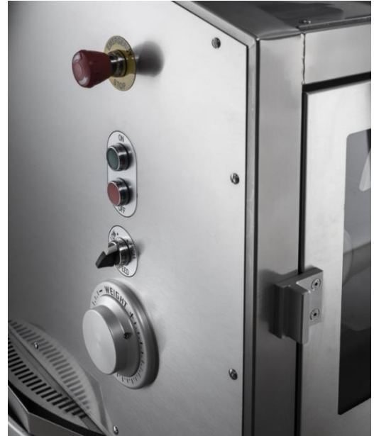
Controls: Emergency Stop, On / Off Buttons, Speed Control and Dough Weight Control