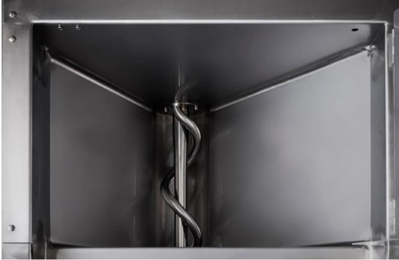
Inside View of the Auger