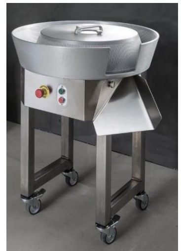
BMDBR3L Dough Ball Rounder with Legs

** Due to continuous product improvement, specifications are subject to change without notice.