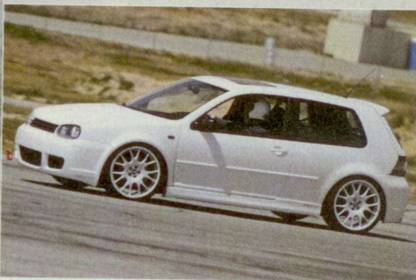
Jeff Campbell's unique white R32 turbo