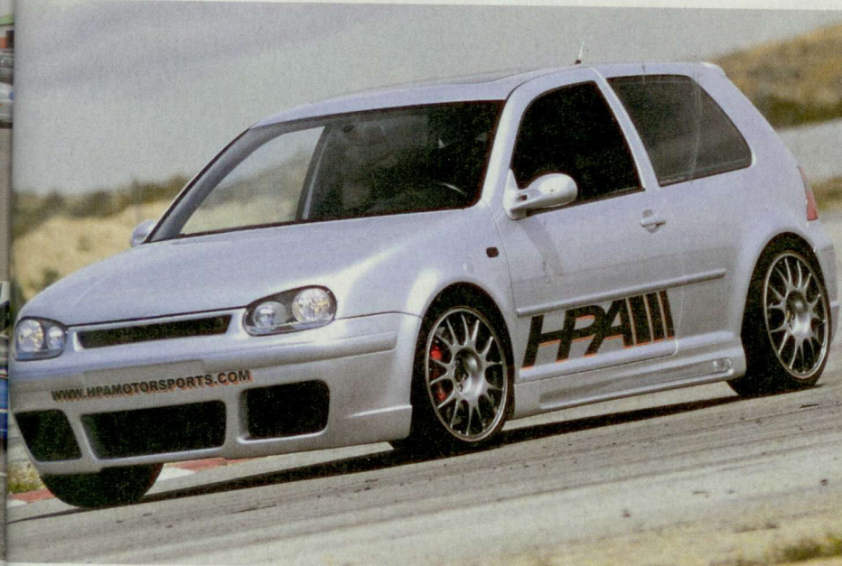
HPA's FT565 ran in valet mode most of the day but was still one of the fastest out there

The tuner that traveled farthest to the show was EIP Tuning of Maryland. They drove their trailer cross-country with a daily-driven, stage 1 R32 turbo. VF Engineering introduced its new stage 3 supercharger kits and had R32s equipped with its 450hp supercharger kit.