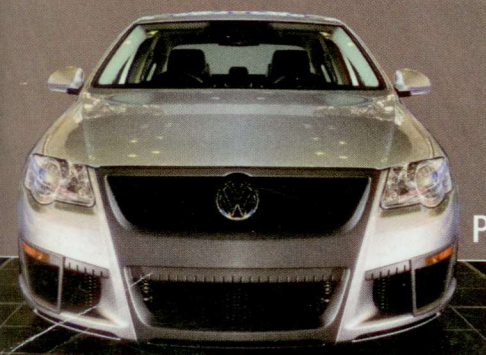
Passat R GT

Mk5 GTI – Behind the scenes of Speed TV's Street Tuner Challenge