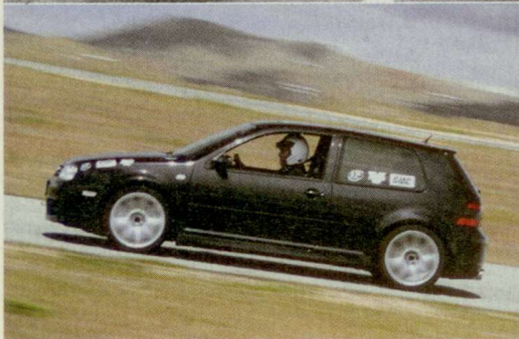
VF Engineering S3 R32