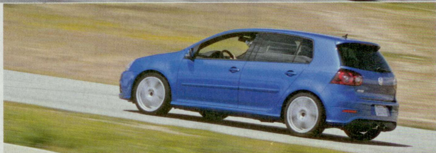
VW brought along the only Mk5 R32 in the country