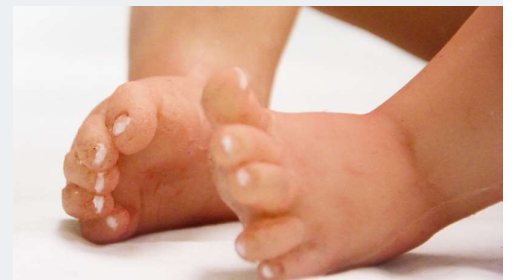
Flexible limbs, back, and neck