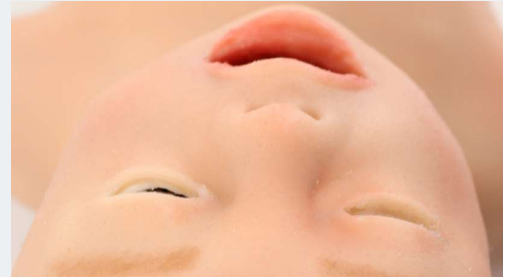
Realistic look and feel