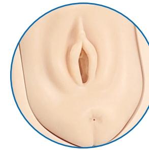
Soft touch silicone skin