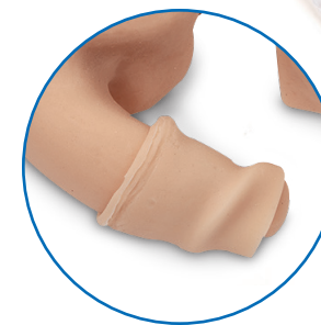
Removable foreskin (male)