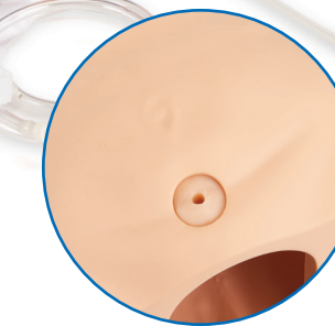
Suprapubic catheterization training