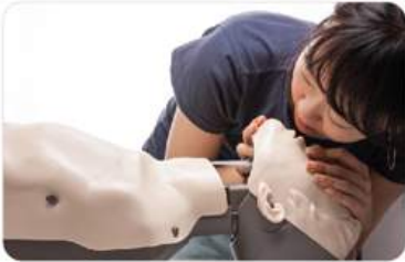
Highly realistic chest movement with correct ventilations