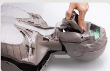
Remove skins, then lift chin