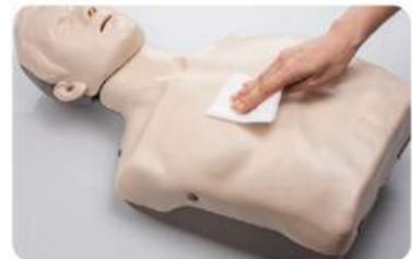
Quick and easy clean-up