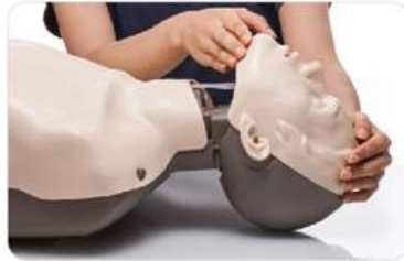
Head tilt and chin lift for opening airway