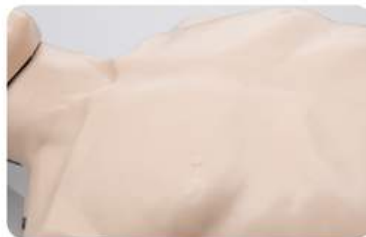
Harmless skin (RoHS, REACH) and materials