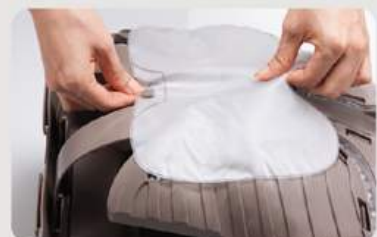
Insert the hall of artificial lung into the guide