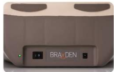
Two way of power supply (Battery, AC power)