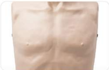
Anatomical landmarks (sternum, ribcage, sternal notch and xiphisternum)