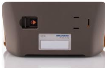
Label for record of management information