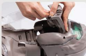
Insert the artificial lung into the slot