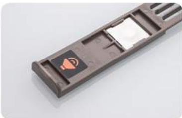
Audible feedback reinforces correct compression depth (Clicker ON/OFF)