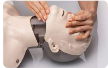
Oral and nasal passages which allow realistic nose pinch