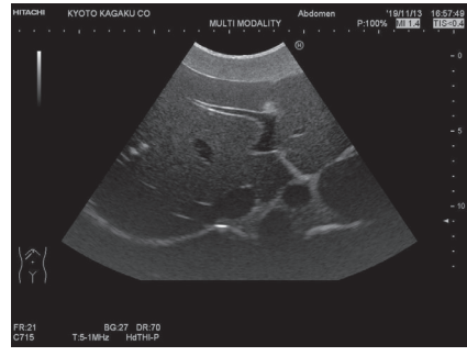
Ultrasound Images (Liver)