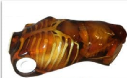
Adult Human Torso for X-RAY CT and MRI training SKU: TO-C01 – 1 Unit