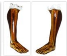
Adult Human Legs for X-RAY CT and MRI training SKU: LG-A01 – 2 Units