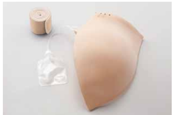
Being compact, the device needs a small space for storage.

Selection of an incorrect site is indicated by blinking of the red lamp and buzzing. Successful puncturing at the correct site is indicated by the green lamp. (Only at Clarke's point and Hochstetter's point)