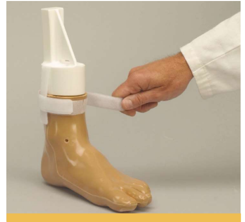
Step 1: Remove the model from the bone clamp.

Step 2: Remove the 1" Velcro strip from the soft tissue ankle.