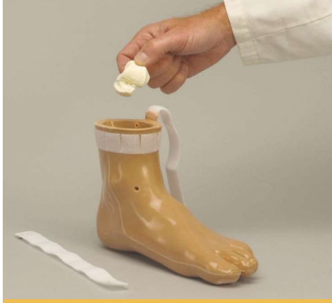
Step 1: After the tibia/fibula insert has been removed, the talus may be grasped with fingers and extracted from the model.

Step 2: To replace, reverse the procedure making sure the talus is fully seated within the model.