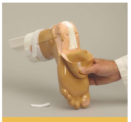
Step 1: Remove 1" Velcro tab from posterior section of foot.

Step 2: Retract skin flap exposing the plantar fascia ligament and remove ligament.