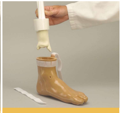
Step 1: Replace 1" Velcro tabs to vice block.

Step 2: To replace, reverse the procedure making sure the talus is fully seated within the model.