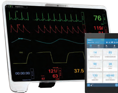
Virtual patient monitor sold separately. Product model may vary from the one shown.