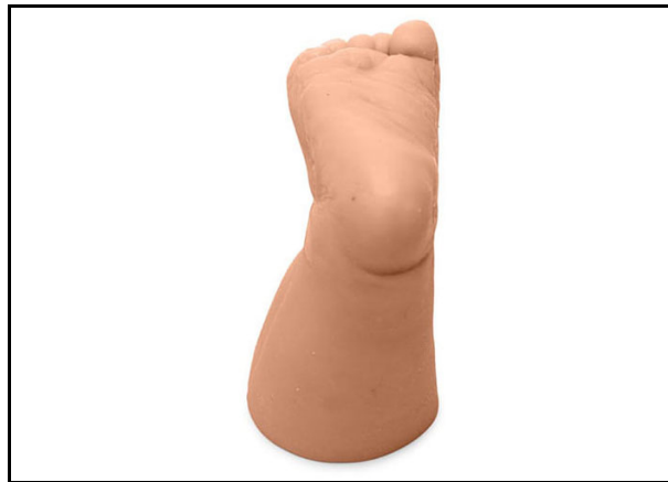
CAE Medicor Infant Foot for Blood Sampling

This model is intended as a platform for the practice of blood extraction for newborn blood sampling.