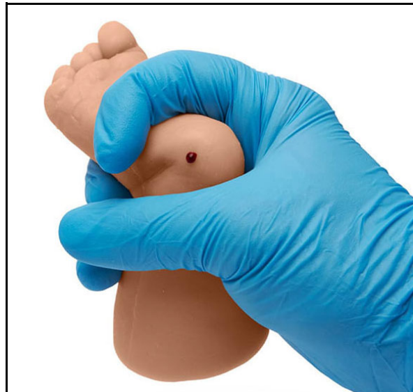
Extracting a Blood Droplet

To practice blood sampling, gently squeeze the heel of the foot to extract a blood droplet.