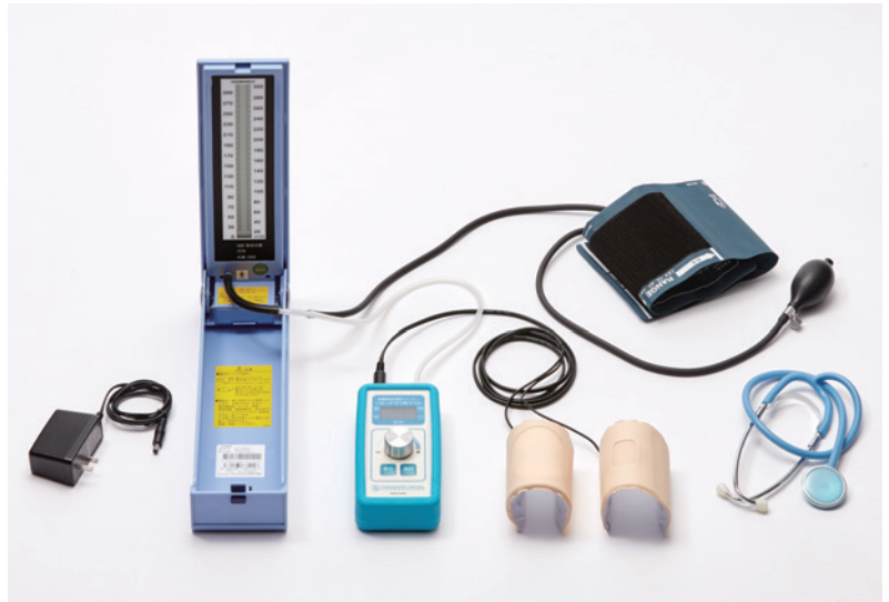
*Standard unit does not include sphygmomanometer.

For better measurement technique of pulse palpation and auscultation